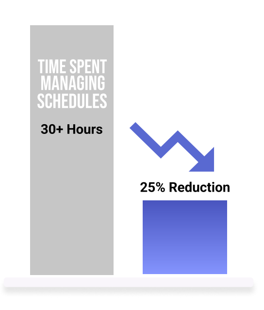
Saving 10+ hours per week.

PowerTime allowed real-time schedule updates that eliminated duplication and printing. Chief Zerbe can now build schedules for the whole year and adjust them quickly, reducing time spent on scheduling by over 25% — saving 10+ hours per week.